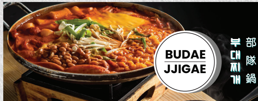
a popular korean-american fusion stew derived after the korean war ( for 2-3 persons )